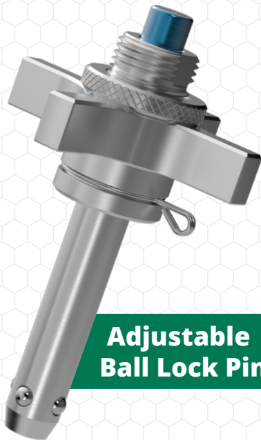
Adjustable Ball Lock Pins