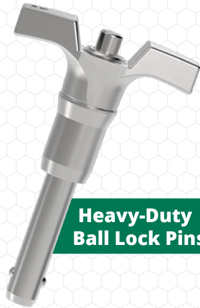
Heavy-Duty Ball Lock Pins