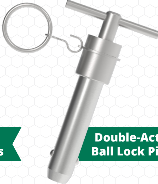
Double-Acting Ball Lock Pins