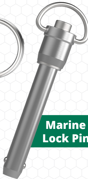
Marine Ball Lock Pins